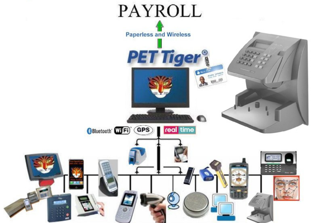
Through the use of mobile smart and dumb devices, biometrics, and electronic capabilities, Orange Enterprises, Inc. develops customized labor management solutions for agricultural operations.