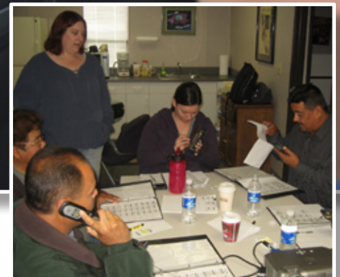
Orange Enterprises Inc. staff member (upper left) conducts a PET Tiger training session for employees at Lagomarsino Farming in Calif.

locations. Specializing in the agricultural sector, customized software solutions from Orange Enterprises Inc. improves efficiency, transparency, connectivity, compliance and mobility for growers, packers, shippers, labor contractors, and other agricultural related operations. With this tool, employers are able to establish vertical accountability as they efficiently track every aspect of labor with accuracy.