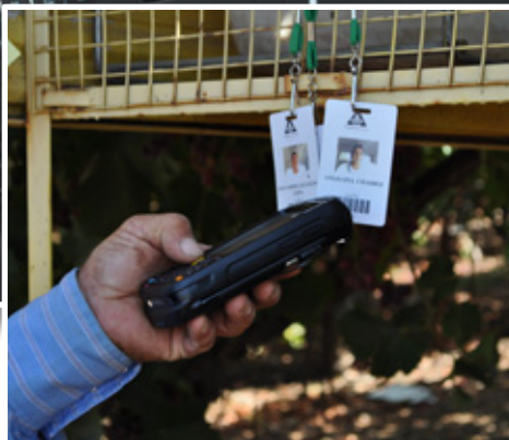
A Lagomarsino Farming employee scans a employee tag with a PET Tiger handheld device.

Since 1984, Orange Enterprises Inc. ( www.TigerJill.com ), a Fresno, Calif. agency, has been developing, marketing and servicing PET Tiger programs at thousands of worldwide